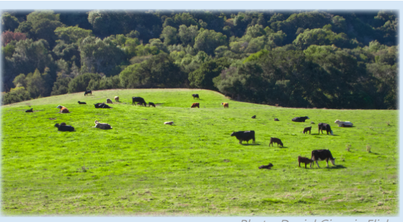
Cattle grazing in Wildcat Canyon Regional Park.

Rangeland is defined by any number of factors, including ecosystem type, dominant vegetation, and utility for livestock grazing. While not all definitions include explicit mention of grazing, rangelands in California provide millions of acres of critical forage—edible grasses, forbs, and shrubs—to support the state's cattle, sheep, and goat ranchers. Rangelands also provide a variety of valuable ecosystem services, such as habitat for endangered species like the San Joaquin kit fox and California tiger salamander, as well as numerous cultural benefits <sup>1</sup>. However, rangelands are experiencing a wide variety of impacts due to drought, and as a result, ranchers are increasingly pushed to new lengths of adaptation.