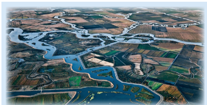
Photo courtesy of Bureau of Land Management Central Valley Project Canals.

In an average year, the SWP delivers to farmers 1 million acre-feet (MAF) 3 of water, and the CVP delivers 5 MAF 4 . However, allocations have been dramatically reduced during the current drought. The Department of Water Resources cut all SWP contracted allocations, including those to agriculture, to 20% in 2015 5 . The US Bureau of Reclamation had to fully eliminate the agricultural share of CVP allocations for many agricultural contractors. These cuts were made to meet the minimum water delivery amounts to preserve public health and safety for municipal and industrial water users. However, some Delta farmers retained 75% of their allocations by agreeing in advance to cut use by 25% 6, 7 .